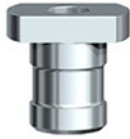
Guided Pilot Drill Sleeves