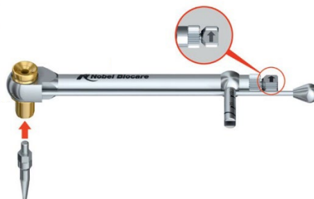
Figures A: Connection of Implant Retrieval Instrument to Manual Torque Wrench Surgical using a Manual Torque Wrench Adapter

Warning: Connect the Implant Retrieval Instrument to Manual Torque wrench adapter and Manual Torque wrench surgical.