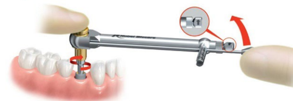
Figure D: Unscrewing the Implant by Rotating the Manual Torque Wrench Surgical in Counterclockwise Direction

Warning: Excessive torque on the Implant Retrieval Instrument may damage or fracture bone structure.