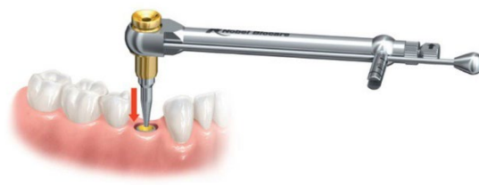
Figure B: Placement of the Implant Retrieval Instrument into the Implant

Note: For removal of implants with internal tri channel connection, where the connection has collapsed, an Implant Rescue Collar and Handle may be used to facilitate implant removal (refer to Nobel Biocare Instructions for Use IFU1058 for detailed information on the Handle For Rescue Collar) (Figure C).