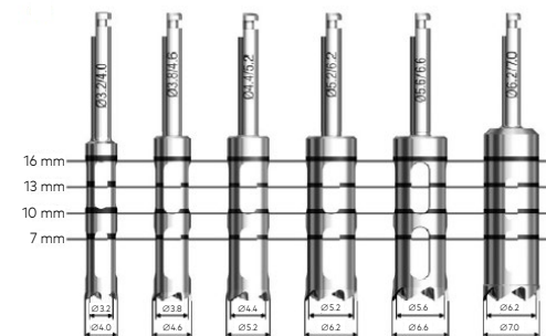
Figure E: Depth Markings on Trephine Drills

To avoid an oversized osteotomy, ensure that the selected Trephine Drill only slightly exceeds the implant diameter.