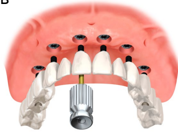
Figure B: Inserting the Prosthesis into the Patient's Mouth

3. Close screw access channel using conventional techniques.