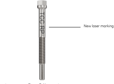
Figure A. Old version Figure B. New version

Note: A new version of the previously existing retrieval tool has to be used, this new version is longer and can be identified by the presence of the laser marking of the platform (e.g. NP or RP) and type of connection (i.e TCC) on the same side of the tool. Below a representation to facilitate the identification of the new version.