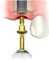
Figure A: Tightening the Cover Screw

Caution: Tighten the cover screw only finger-tight to avoid excessive loads that might damage the cover screw parts.