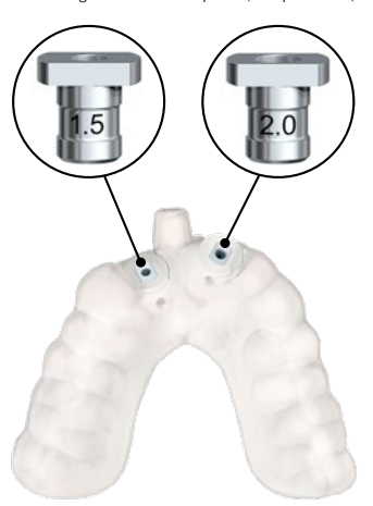
Picture 1: Example of a comparison of laser marking on Guided Pilot Drill Sleeves with planning overview

Please confirm that the correct sleeve size is used for each position by comparing the laser marking of the Guided Pilot Drill Sleeves with the planning overview before inserting it into the template (see picture 1).