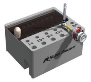
Drill Stop Kit Box for Freehand Surgery