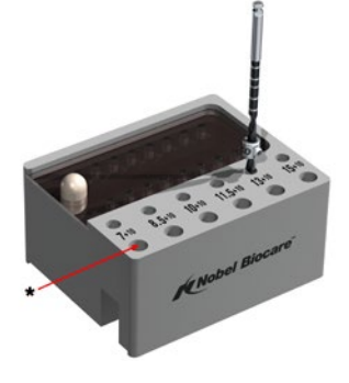
Drill Stop Kit Box for Freehand Surgery