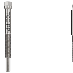
Old Version New Version

Note The new version of the previously existing Abutment Retrieval Tool Nobel Biocare N1™ TCC presents a latch connection that is compatible with the Handle for Machine Instruments or the Manual Torque Wrench Prosthetic Adapter.