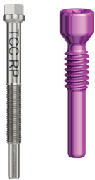
Figure B – Abutment Retrieval Instrument Titanium CC and Abutment Retrieval Tool Nobel Biocare N1™ TCC old version.

The Abutment Retrieval Tool Nobel Biocare N1™ TCC (new version articles 301521, 301522, 301533, 301534) is used to remove titanium abutments. It consists of a pin with a threaded portion that is threaded through the abutment inner threads. It has to be connected to the Handle for Machine instruments or the Manual Torque Wrench Prosthetic Adapter. By applying torque with the handle, the unthreaded portion of the pin comes into contact with the implant, which pushes the abutment up so that it can be removed by hand. The Abutment Retrieval Tool Nobel Biocare N1™ TCC new version is available in the NP and RP platform sizes, short and longer version, and it is compatible with Nobel Biocare N1™ TCC titanium abutments. Refer to Table 2 for compatibility summary.