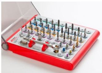
Figure 3: Reassembled Kit Box with mounted instruments.