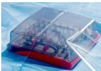
Figure 4: Assembled Kit Box packed in sterilization pouch.

Note: The Kit Boxes are not intended on their own to maintain sterility; they are intended to be used in conjunction with a legally marketed, validated, FDA-cleared sterilization pouch or sterilization wrap in order to maintain sterility of the enclosed medical instruments until used.