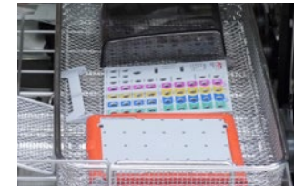
Figure 2: Disassembled kit box loaded into washer/disinfector.