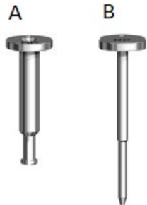
Figures A and B: Hollow Cylinder (A) and Activating Pin (B) of Two-piece Abutment Retrieval Instrument Zirconia CC

The Abutment Retrieval Instrument Zirconia CC is used to remove zirconia abutments. They are comprised of two pieces: one is a hollow cylinder ("engaging pin", Figure A) that is placed through the screw access hole of the zirconia abutment/prosthesis, and the second piece (Figure B) is the "activating pin" that is inserted through the engaging pin. After using forceps to compress the two components, the engaging pin engages the abutment and lifts it vertically, so that the abutment can be removed by hand.