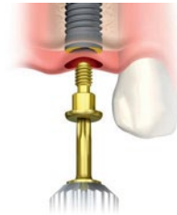
Figure A – Tightening the Cover Screw

Caution Tighten the Cover Screw only finger-tight to avoid excessive loads that might damage the Cover Screw parts.