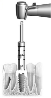
Figure F: Placement of Trephine Drill Over Implant