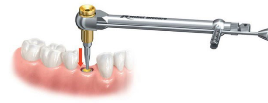
Figure B: Placement of the Implant Retrieval Instrument into the Implant

Note: For removal of implants with internal tri channel connection, where the connection has collapsed, an Implant Rescue Collar and Handle may be used to facilitate implant removal (refer to Nobel Biocare Instructions for Use IFU1090 for detailed information on the Handle For Rescue Collar) (Figure C).