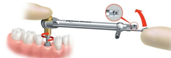
Figure D: Unscrewing the Implant by Rotating the Manual Torque Wrench Surgical in Counterclockwise Direction