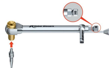
Figures A: Connection of Implant Retrieval Instrument to Manual Torque Wrench Surgical using a Manual Torque Wrench Adapter

Warning: Connect the Implant Retrieval Instrument to Manual Torque wrench adapter and Manual Torque wrench surgical.